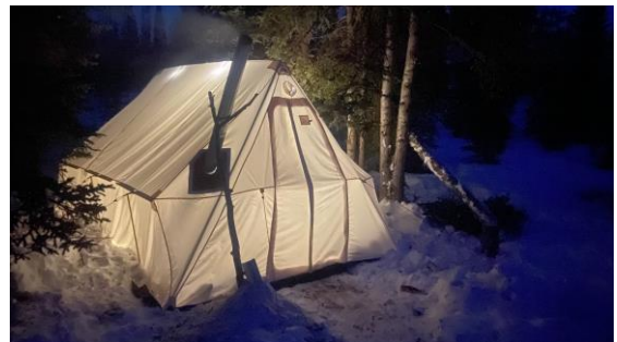
Snowtrekker Wall Tent and Stove