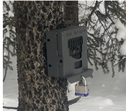
Reconnyx Trail Camera