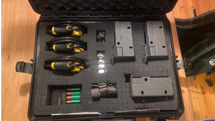
Reconnyx Trail Camera Case, Batteries and Locks